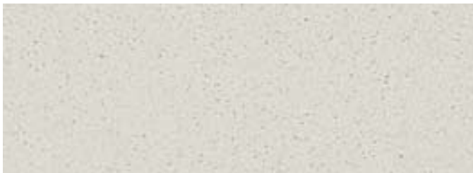
15246 bright white