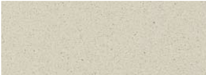
15201 oyster white

clean environments, low maintenance HIGH PRIORITY