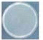
Staphylococcus aureus MCare ® anti-microbial inhibits growth