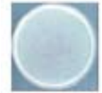
Escherichia coli bacteria growth