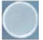
Escherichia coli MCare ® anti-microbial inhibits growth