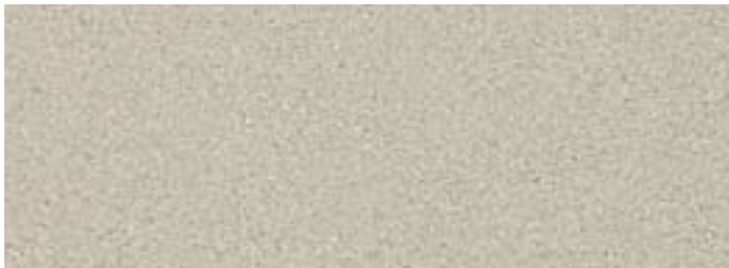
15240 cool beige