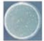
Staphylococcus aureus bacteria growth