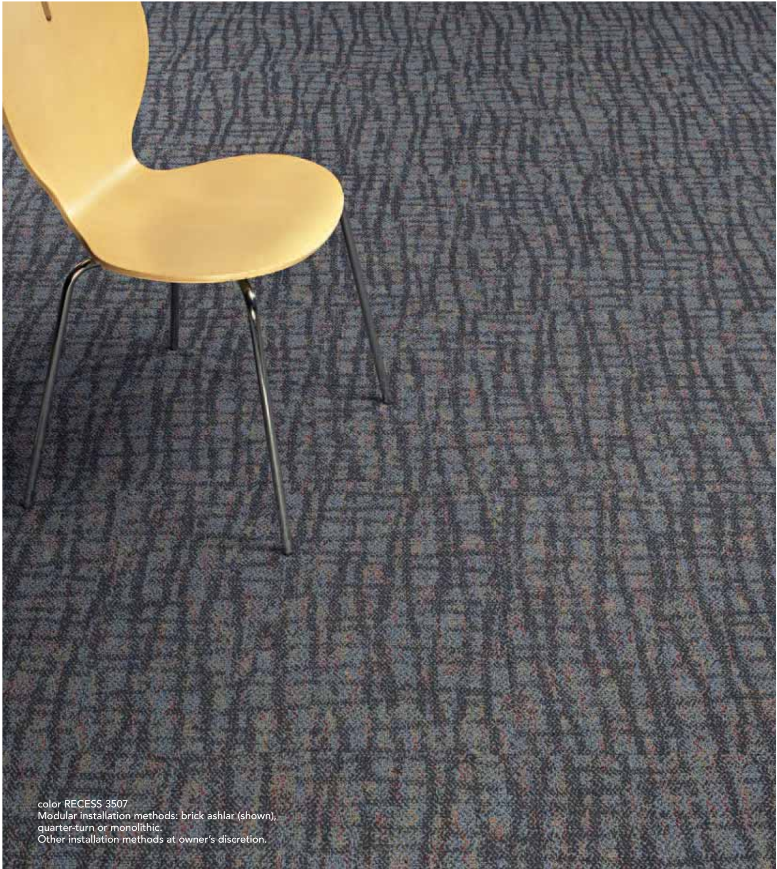
color RECESS 3507 Modular installation methods: brick ashlar (shown), quarter-turn or monolithic. Other installation methods at owner's discretion.